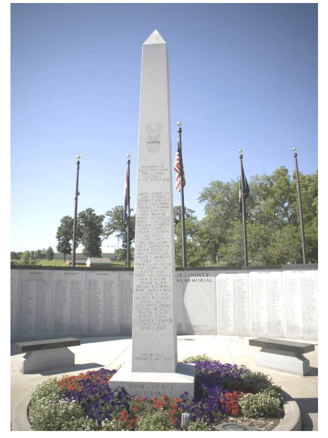
Adair County Veterans Memorial Plaza