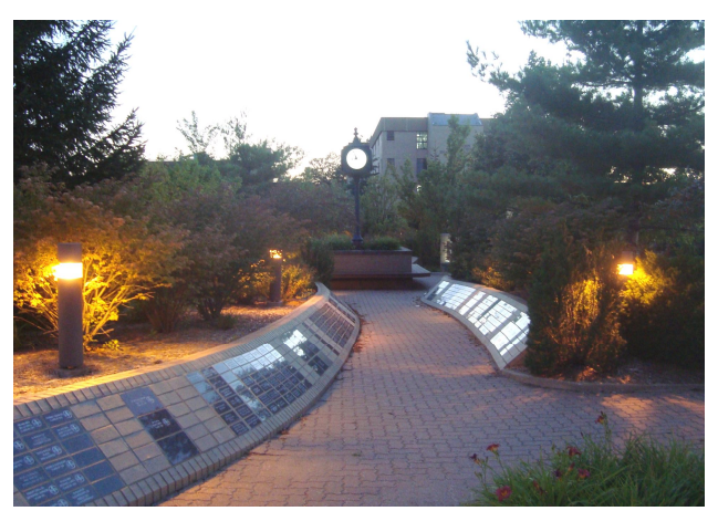
Centennial Park at A.T. Still University