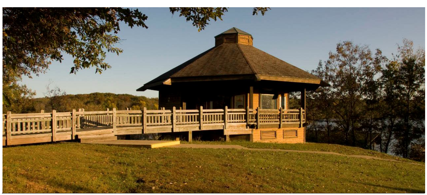
Thousand Hills State Park Petroglyph Shelter