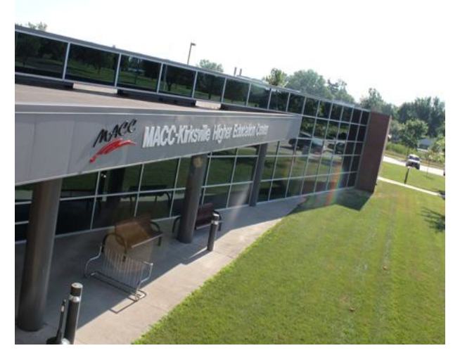
Moberly Area Community College