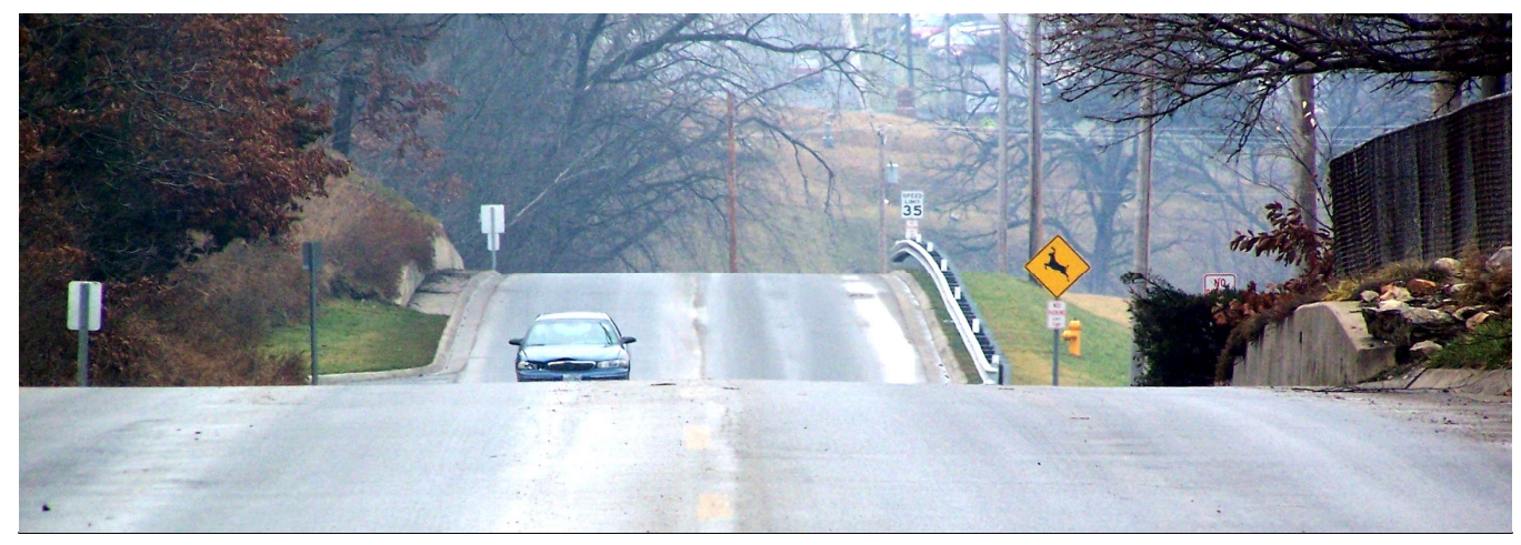
North Osteopathy Street