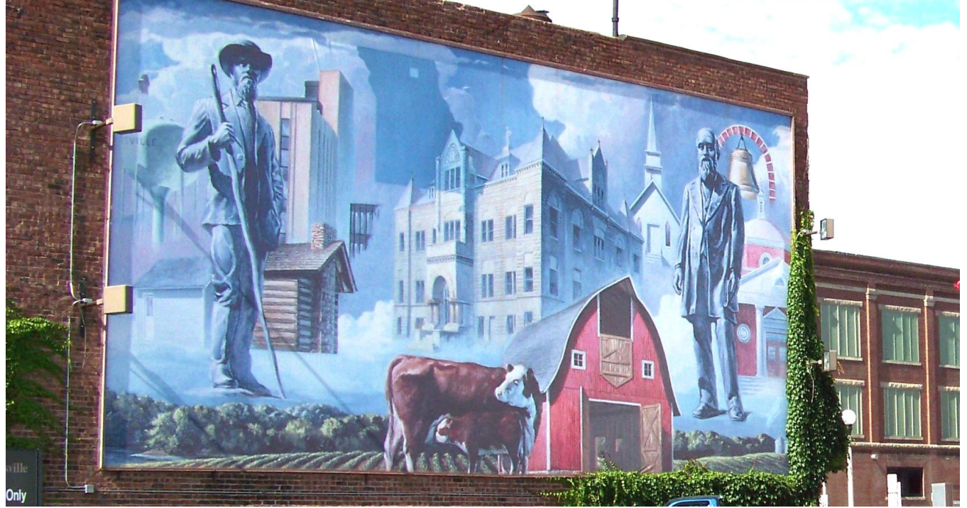
Mural in Downtown Kirksville