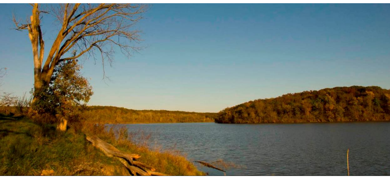
Forest Lake at Thousand Hills State Park